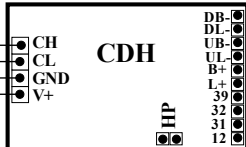
CDH Board Button connections are the same with CFU board.

Connections on this diagram are for full collective systems. For simple collective, simple push-button and one-way collective systems connect only one button.